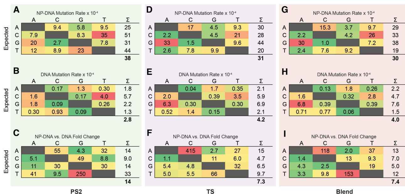
Figure 3. Mutation matrices for RT primer extension products on synthetic templates. Expected (rows) versus observed (columns) base calls for the extended RT product strand for DNA polymerization activity of either PS2 (A–C), TS (D–F) or a 1:1 blend of both enzymes (G–I) on either NP-DNA (A, D and G) or DNA (B, E and H) synthetic templates. Each entry shows the rates ( \times 10^{-4} ) of each observed substitution mutation relative to the reference sequence. The right-most column in each table is the summation ( \Sigma ) of all mutation rates for each expected base, and the overall mean of these values is given below each table. In this analysis, only base substitution calls were considered. See Supplementary Figure S4 for methodological details. (C, F and I) Fold-change in mutation rate for NP-DNA versus DNA templates for PS2, TS, or a 1:1 blend, respectively. Color in each cell is mapped between the maximum (red) to minimum (green) normalized within each table. Extension reactions contained 250 nM PS2 (A–C), 250 nM TS (D–F) enzyme or a blend of 125 nM PS2 and 125 nM TS (G–I). In all cases, the reaction was carried out at 42°C with 1 mM each dNTP in buffer A, containing 8 mM Mg^{2+} .